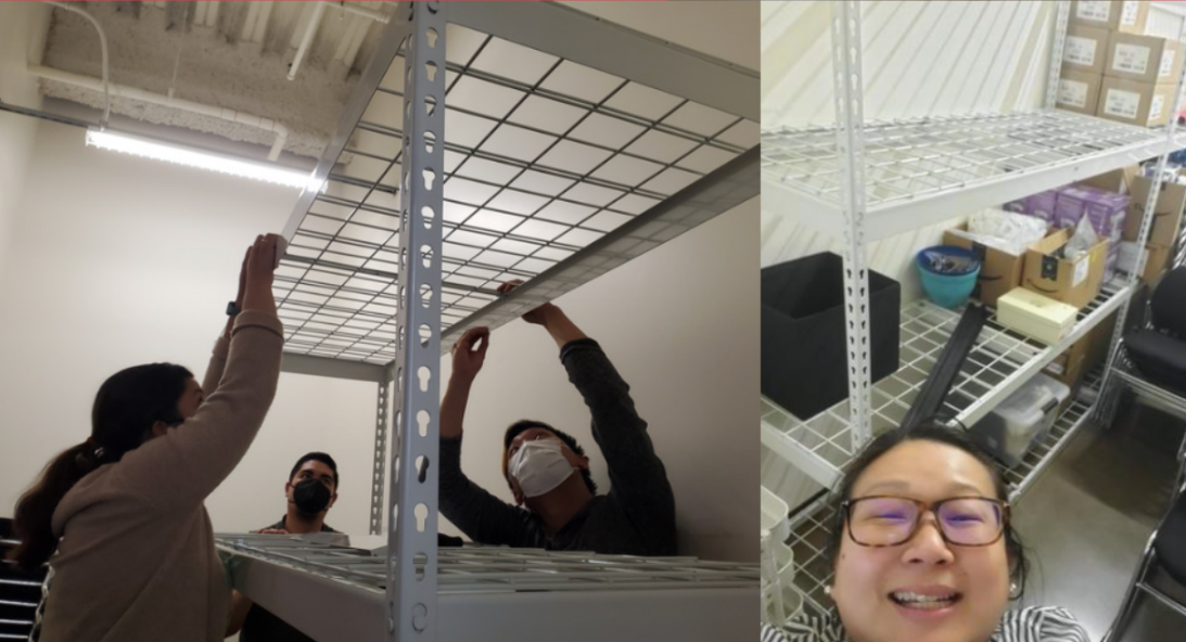
Getting ready for our Grand Opening Celebration!

OMG. I am so excited about our new shelving units. We have new shelves in our storage room, in our lounge area, and in our Quiet Room. You may be asking why would shelves get a prime-time feature in our newsletter - Well, shelves mean we have stuff to put on them! And, yes, the APIDA Center is getting a lot of stuff! We are still building our space and will continue to do so over the next few months. We still have much more to do but it has come a long way since we moved in last summer.